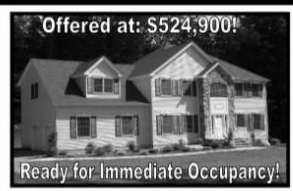
Please visit: www.weichert.com (Search MLS#: 2496642) for Additional Photos & Information.

Lowest Priced "New Construction" in Lebanon Township!