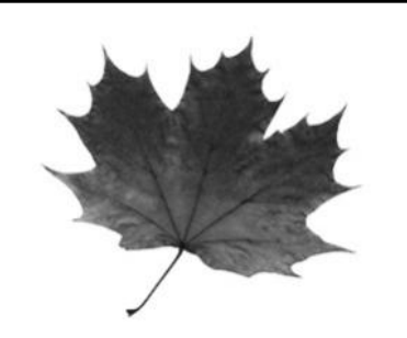
September, October, November