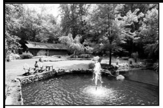
Please visit: www.weichert.com or www.realtor.com (Search by MLS#: 2788709)