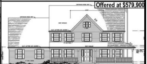
Offered at $579,900

Updated Colonial located in a convenient neighborhood. Large formal living room w over-sized window. Elegant dining room w bump out bay window. Renovated kitchen w custom cabinetry, quartz counters, decorative tile, pantry & sliding glass door to rear deck w pergola. Recently added between the kitchen and the family room is a Silestone topped breakfast bar that supplies additional seating & storage. Spacious vaulted ceiling family room has a brick wall w wood-burning fireplace. Master bedroom retreat w organized walk-in closet. Newer master bath w stall shower & beautiful tile. Finished basement recreation room. Private 1.5 acres with natural setting.