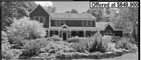
Offered at $649,900

Expansive Colonial w separate 1st floor in-law suite. Gourmet kitchen w Plain & Fancy custom cabinetry, high-end stainless steel appliances & granite topped center island breakfast bar. Living & dining room w tray ceilings. Family room w floor to ceiling field-stone fireplace. Master bedroom w separate sitting room. Master bath has soaking tub & stall shower. All big secondary bedrooms including 2 w en-suite baths. In-law suite w kitchen, dining & living room w dual sided fireplace, bedroom & full bath. Office. Finished daylight walkout basement w full bath. Dual staircases. Sauna. Wrap around deck. Patio. In-ground pool. 5-acre view lot in cul de sac. 4-car garage.