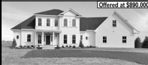
Offered at $890,000

46 Pleasant Grove Road 4 Bedrooms, 3 Full Baths, 2 Half Baths JumpVisualTours.com/227694