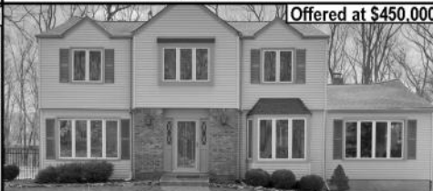
Offered at $450,000

Own a piece of history! Original Parsonage w period detailing -pumpkin pine floors, pocket doors, moldings & high ceilings. Expanded & renovated w attention to detail. NEW SEPTIC just installed! Foyer w transom topped double entry doors & beautiful staircase. Living room w original ornate moldings, medallion, decorative marble surround fireplace & access to deck. Large room w bump out bay window, built-ins & pocket doors opening to kitchen is great for a formal dining room. Renovated kitchen w center island, granite counters, abundant cabinetry, garden window, subway tile & breakfast room w fireplace. Spacious vaulted beam ceiling family room addition. Master bedroom w 2 closets & bath. Mudroom. Wine cellar. Front porches. Expansive deck. Paver surround in-ground pool. Private, landscaped 1.66 acre property.