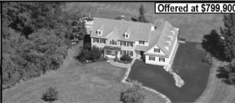
Offered at $799,900

Stunning 4200 sq ft NEW CONSTRUCTION! Designed to take advantage of the unsurpassed panoramic views. Spectacular open & level 4 acres backing to Teetertown Ravine Nature Preserve. Impeccable stylish detailing. White oak flooring on both levels. Exquisite tile. Lavish baths. Expansive, open, flexible floor plan. Raised hearth gas fireplace. Porch. Gourmet kitchen w over-sized center island bar, quartzite counters, tile back-splash, entertaining buffet area & premium stainless steel appliances. Dual masters each have luxurious baths w air tubs & stall showers. 2nd floor master w large veranda. Huge recreation room w wall of windows. 2 laundry rooms. 2 staircases.