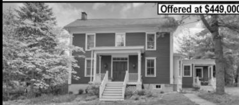
Offered at $449,000

Extensively renovated on private 10-acre oasis. Front porch. Wood floors. Large formal living & dining room. Renovated center island kitchen w honed granite, custom cabinetry & premium stainless steel appliances. Cathedral ceiling family room w floor to ceiling field-stone fireplace. Master bedroom w walk-in closet & balcony. Remodeled master bath w stall shower, jetted tub & tile flooring w radiant heat. Spacious bedrooms. Office w built-ins. Conservatory/Sun room. Finished basement rec room & gym. Multi-tiered lpe deck w pergola. 35 x 26 2-story-2 garage bay outbuilding. Kohler Generator. Hot tub. Landscaped. Deer fencing. Adjacent to Open Space.