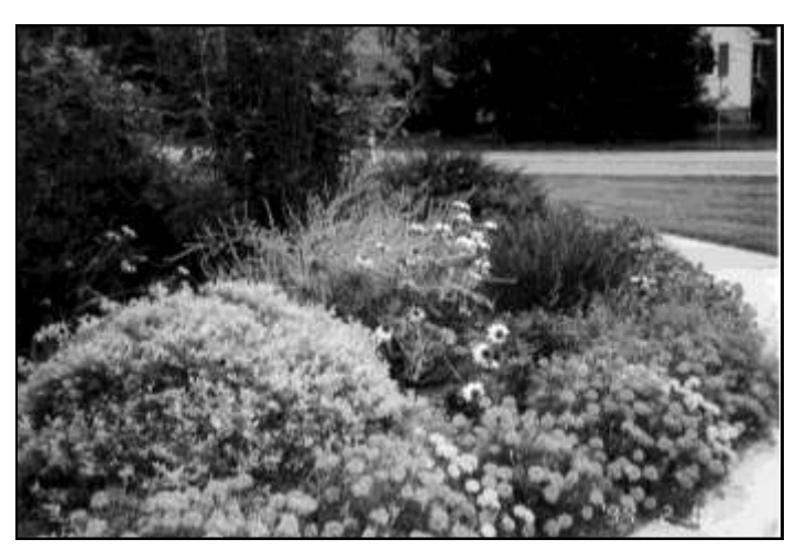
The Bunnvale Library garden in full bloom this past summer.

Remember that you can now request items on-line at home from anywhere in the Hunterdon County Library system and the items can be delivered to the Bunnvale Library for convenient pick-up. Library hours are Wednesday from 1:00 - 8:00 PM, and Thursday, Friday and Saturday from 10:00 AM - 5:00 PM.