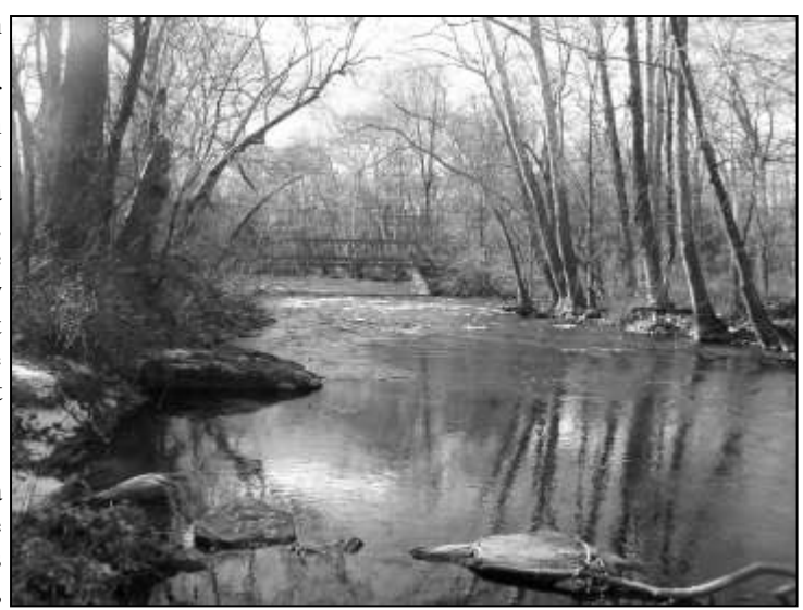
View of the bridge over the Musconetcong River at Point Mountain State Park.

To view more photos and read additional information about the Musconetcong River, go to www.lebanontownship.net and click on the Environmental and Open Space Commission link.