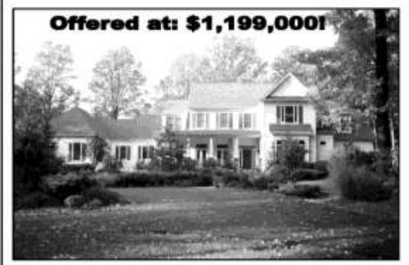
Please visit: www.weichert.com or www.realtor.com (Search by MLS#: 2452868) for a Virtual Tour.

Spring is in the Air... And the Market is Bursting with Great Home Prices!