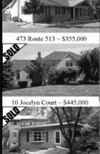
616 Hermits Lane - $345,000

* This representation to below in writter or might an international file Curried State Moliphe Listing Bervice, LLC (*CLSMLS*). USB/LLS does not generate too in its majority responsible for its accuracy. Data maintained by GSMLS may not reflect all real estate activity in the market.