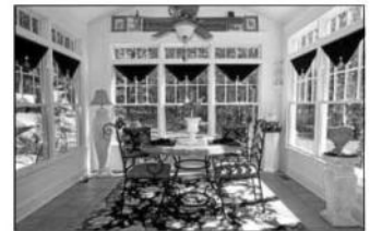
Sunny Breakfast Room