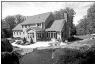
Rear View of Home & Water Garden with Waterfall

Priced at $740,000....A Must See Property!