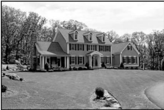
Please visit: www.weichert.com or www.realtor.com (Search by MLS#: 2771140)

Spring is in the Air...And the Market is Bursting with Three Fabulous Properties!