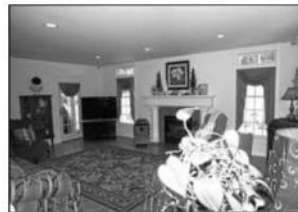
Formal Living Room with Fireplace