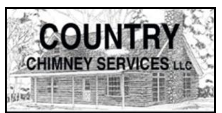
Professional Chimney Cleaning, Maintenance. Repairs & Relining