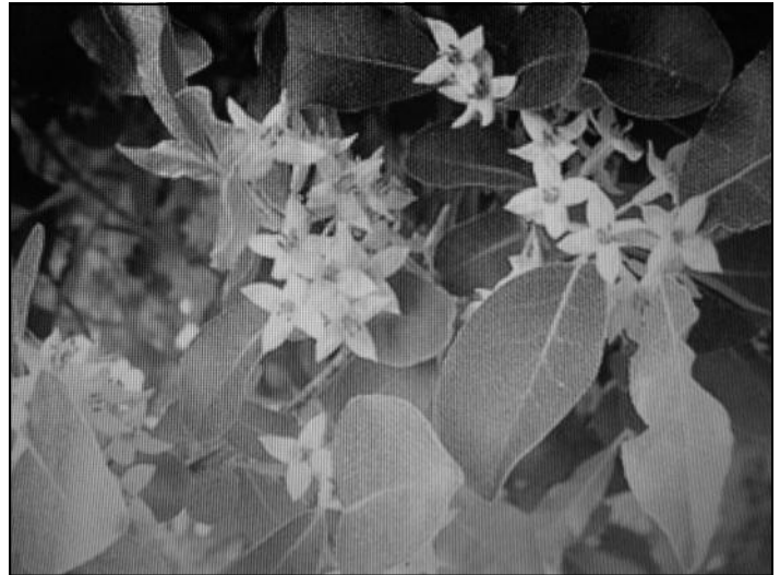
Pictured above, the flowers which appear on the Autumn Olive in spring; and below, the fruit which appears in summer to fall.

INVASIVE ORIGIN: Autumn olive as well as the very similar Russian olive ( Elaeagnus angustifolia ), were introduced in this country to grow in areas with poor or no top soil, mainly for erosion prevention. The roots have nitrogen nodules much like soybeans, allowing it to thrive in poor nutrient soils.